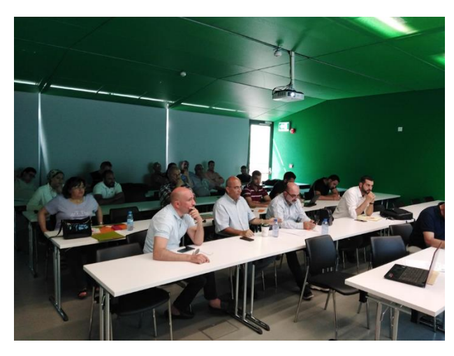
"ToT at the University of Cyprus": First day welcoming of the participants!

The first day included an introductory lesson to PV technology, along with the basics of solar energy, how PV cells produce electricity, and why semiconducting materials are important to achieve this photoelectric conversion. Some additional introductory modules like the PV potential in Cyprus and national legislations around PV technologies were briefly mentioned as well. A PV Laboratory tour has taken place early morning (in order to avoid the intense Cyprus sun in July), where the participants had the chance to meet the advanced in-door equipment we currently have at the laboratory, like the PASAN solar flasher, the electroluminescence technique, the environmental chamber (thermal cycling; Potential-Induced Degradation -PID- stressing), the UV chamber. and the out-door facilities as well like the PID stand, CPVs. CPTs, the inverters, fault detection etc.