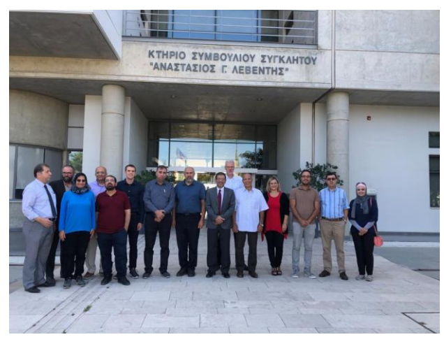
A last group photo before the end of the meeting

The meeting took place at the new library building, where the participants had the chance to learn about the building's bioclimatic capabilities, in addition to its smart design principles.