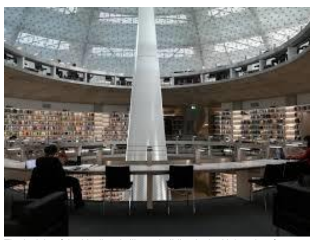
The insight of the bioclimatic library building in the University of Cyprus!

The meeting took place at the new library building, where the participants had the chance to learn about the building's bioclimatic capabilities, in addition to its smart design principles.