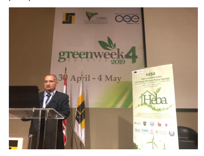
A brief introduction in Heba project during the greenweek4 2019 at the Lebanese University

LU 30/04/2019: greenweek4 2019 – Academic background and learning opportunities in Sustainability. Participation of the Lebanese University in the greenweek4 2019, where HEBA project was disseminated amongst the participants.